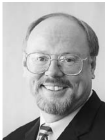
Mayor Steve Northcutt Malvern