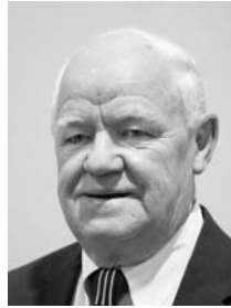
Mayor Billy Helms Clarksville