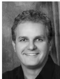
Mayor Doug Sprouse Springdale