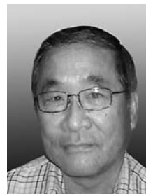
Mayor Ian Ouei Stamps