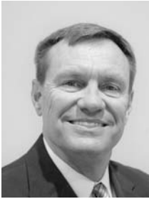
Mayor Rick Elumbaugh Batesville