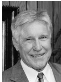
Mayor David Osmon Mountain Home