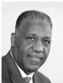
Mayor Carl Redus Pine Bluff