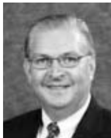
Mayor David Morris Searcy District 2