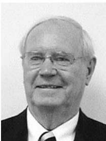
Mayor Gerald Morris Piggott