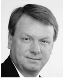
Mayor Tab Townsell Conway 2007