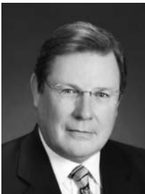
Mayor Mark Stodola Little Rock